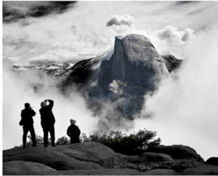
First Place B&W Print by Don Wolfe