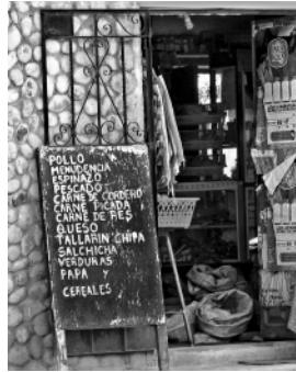
First Place Black & White Print by Barb Hitt

(First Place Slide and Digital not available.)